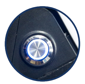
1a. Downtube Battery

Dual battery options include an additional battery on the rear. This functions in a similar way, powering on both batteries when pressed, but does not have an LED indicator light.