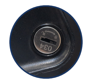
1b. Rear Battery