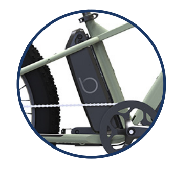
1b. Rear Battery