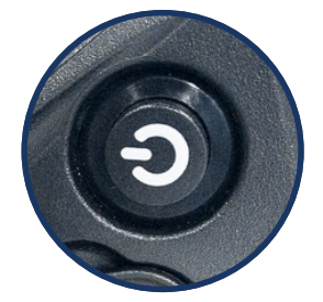
1b. Rear Battery